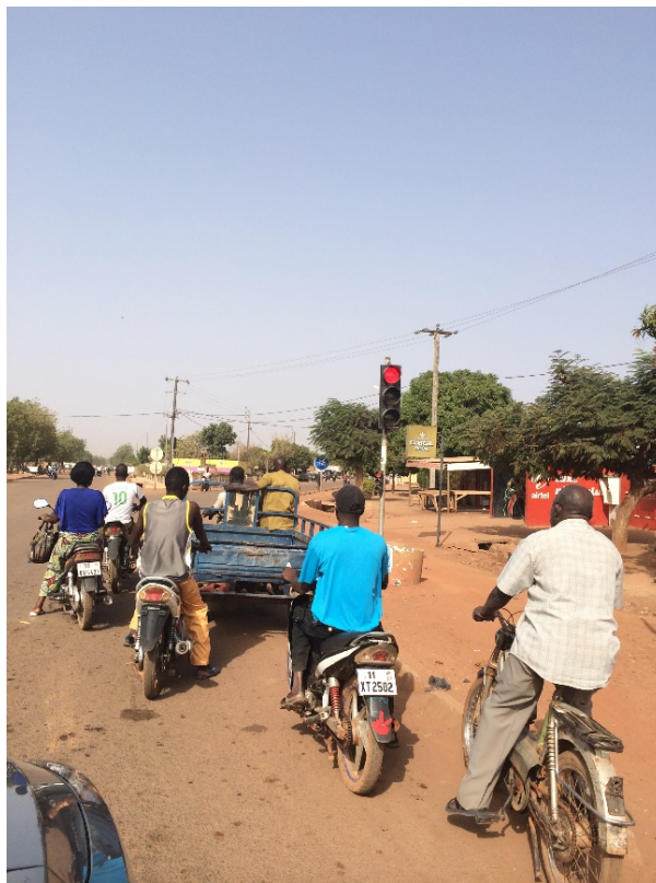
Figure 1. Unpaved street in the center of Koudougou.

Koudougou, after leaving its suburbs, stands as a true open-air shopping center. The city offers all conceivable sales activities: fresh food, restaurants, cafes, workshops and stores where everything is sold, from mechanical parts to clothes imported from abroad, music that wafts from taverns. And individuals on bikes, on motorcycles, on foot, and more rarely in cars. Koudougou is a lively, vibrant town. And this, even though the size of the buildings remains modest, rounded-up buildings, glued to each other in the centrality of a vast territory. And