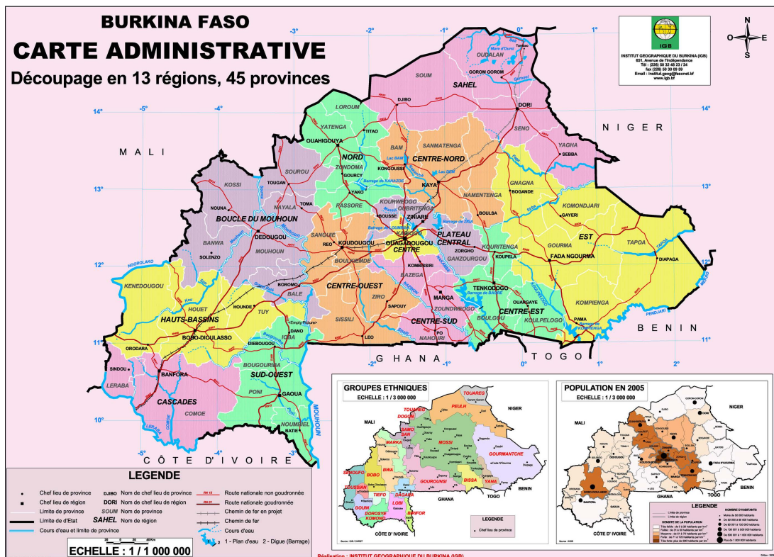
Figure 2. Administrative map of Burkina Faso (United Nations, 2014).

For evaluators from the World Bank, the contemporary urban development in Burkina Faso is divided into three periods: from 1960 to 1983, urban planning emerged in the light of colonial times, with two types of zoning, one for the poor indigenous, and the other, residential and equipped with roads, drainage and electricity, for Western expatriates and African officials. The revolution led by Sankara in 1983 had an urban impact; land was nationalized, and a public national land agency was created. A highly centralized national policy was conceived to regulate land and housing issues. This was the beginning of the creation of many housing developments and land grants. Since 1990, after the fall of the ruling regime, the new government began negotiations with the World Bank in order to create and strengthen technical departments responsible for urbanization in Ouagadougou as well as in Bobo-Dioulasso, the two main cities in the country (World Bank, 2002).